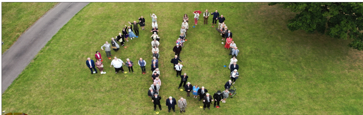
Cheshire Neighbourhood Watch Association celebrate our 40th anniversary

FOR NEIGHBOURHOOD WATCH SUPPORTERS ACROSS ENGLAND & WALES